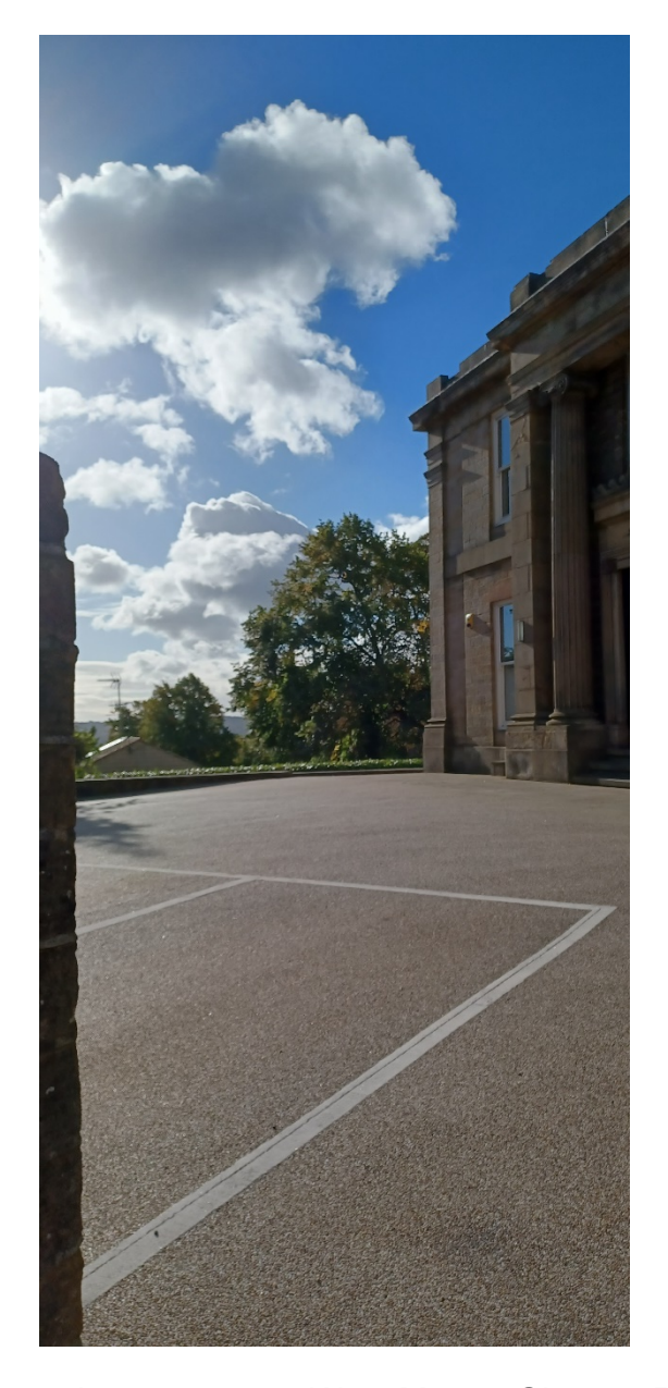
View of the tree from the entrance to West Mount, Glossop Road